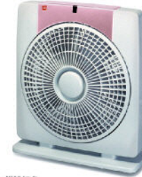
銀粉紅色 Silver Pink