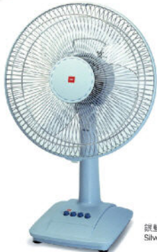
銀藍色 Silver Blue

V30AH 30cm (12") / V35AH 35cm (14") / V40AH 40cm (16")