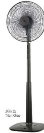
炭灰色 Titan Gray