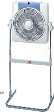
銀藍色 Silver Blue