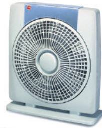
銀藍色 Silver Blue