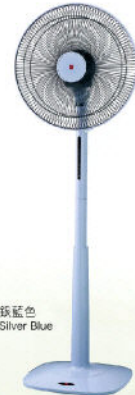
銀藍色 Silver Blue