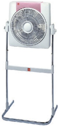
銀粉紅色 Silver Pink